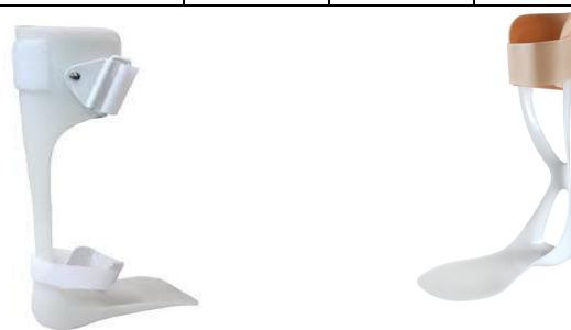
Leaf Spring and Swedish AFO