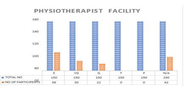
Figure 1. Physiotherapist Facility

some patients did not provide responses as they didn't get through the facility, about 28.1% didn't provide responses. Graphical representation is given below in Figure 1.